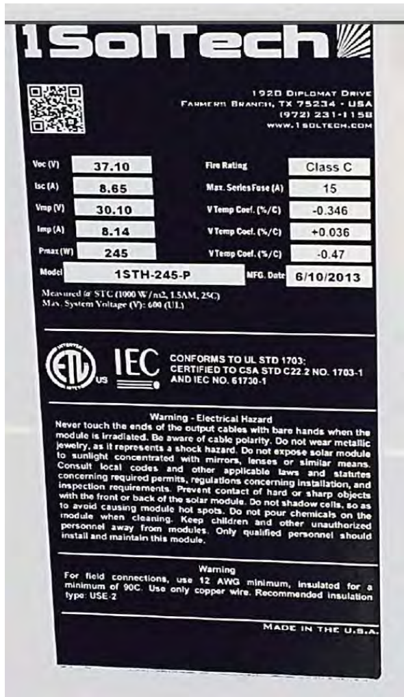
Photovoltaic Module Panel Model 1STH-245-P Manufactured on June 10, 2013